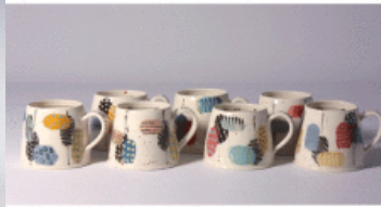
Irena Sibrijns £38 - £78