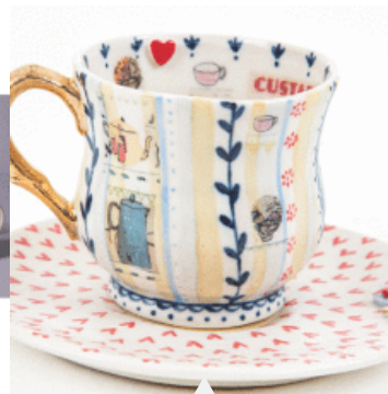
Katie Almond £34 - £47