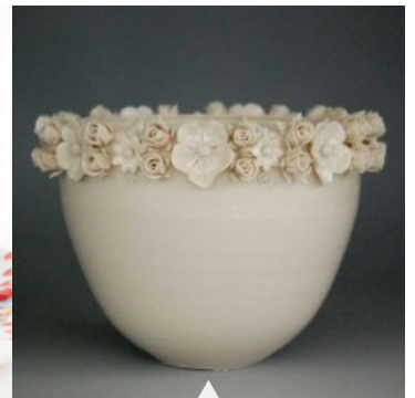
Emma Clegg £32 - £85